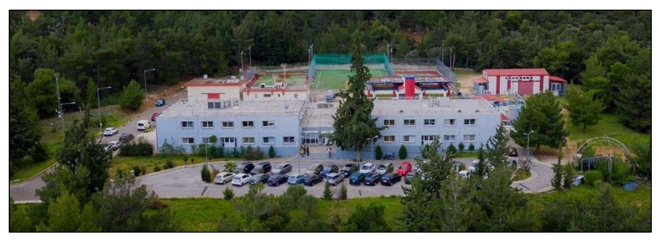
Figure 1: the Institute of Nanoscience & Nanotechnology "Demokritos"